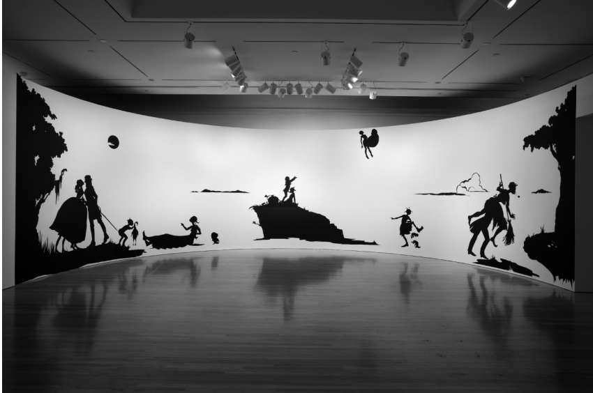
Figure 9 Kara Walker, Gone, An Historical Romance.. (1994). Installation view: Kara Walker: My Complement, My Enemy, My Oppressor, My Love, Hammer Museum, Los Angeles, 2008.

Walker’s reworking of the Southern romance, especially her foregrounding of interracial relations, evokes Morrison’s narrative of the Southern past, Golden Gray’s story in Jazz . Golden Gray is an eighteen-year-old youth, the illegitimate son of Vera Louise Gray, a Southern aristocrat exiled from her family plantation for carrying a black child as a consequence of her covert relationship with a black slave, Henry Lestory/LesTroy, known as Hunters Hunter. Due to his light skin color, Golden Gray has been raised as white and was only recently informed that “his father was a black-skinned nigger.” 32 In order to confirm his self-identity as a white gentleman, he sets out on a patriarchal adventure, seeking to kill the black father who had had illicit sex with his white mother. During his trip from Baltimore to Virginia, Golden Gray encounters a pregnant black woman, who is later called Wild. Wild plays a crucial role in altering the Faulknerian oedipal scenario. For, according to the narrator, Golden Gray did not “kill . . . his father” ( J 143) or “blow