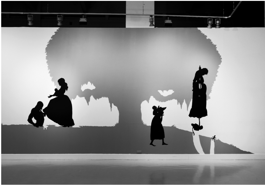
Figure 11 Kara Walker, The Long Hot Black Road to Freedom, a Double-Dixie Two-Step [detail] (2005–8). Cut paper and paint on wall, 15 × 150 feet (4.6 × 45.7 meters). Installation view: Kara Walker: The Black Road, CAC Málaga, 2008.