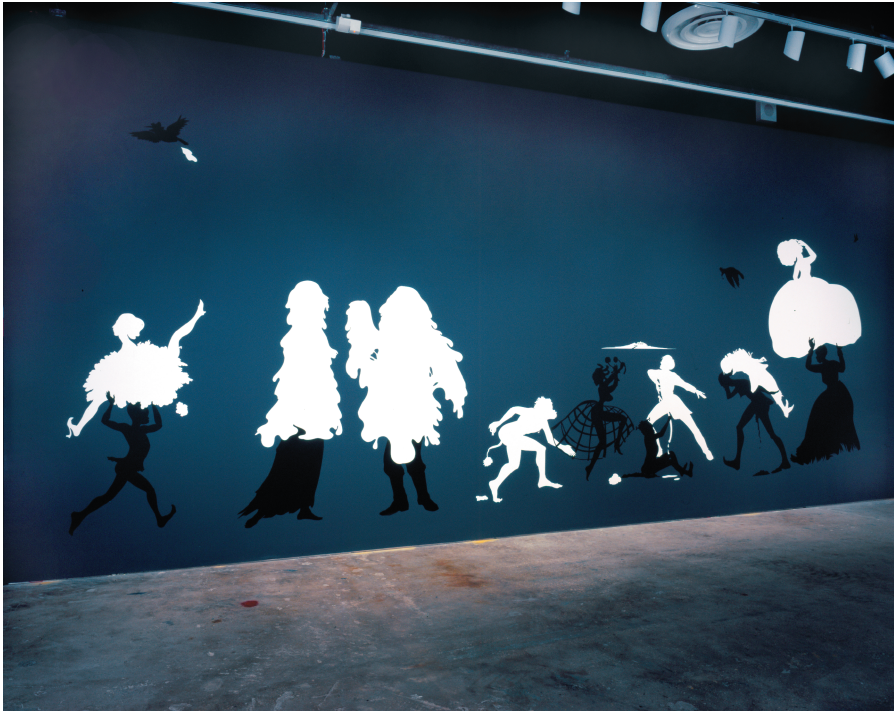
Figure 10 Kara Walker, The Rich Soil Down There (2002). Cut paper and paint on wall, 15 × 33 feet (4.5 × 10 m). Installation view: Tempo , Museum of Modern Art Queens, Queens, NY, 2002.

verts the convention of miscegenation stories in which “a white slave owner overpowers and impregnates his black female slaves, characteristically without the women’s consent and in situations more analogous to rape than seduction.” 35 Hunters Hunter (a black male slave) is sexually desired by Vera Louise (a white lady), and their sexual act is a mutual seduction. Vera Louise never mentions the name of the baby’s father, and Hunters Hunter keeps her “green dress” for eighteen years ( J 172). Implying nothing more, however, Morrison foregrounds only the mutual sexual attraction between the former slave and the white lady. Likewise, Morrison leaves ambiguity in the relation between Golden Gray and Wild. Golden Gray is sexually attracted to Wild, and Wild also hungers for his golden hair ( J 167). Yet, despite their togetherness and cohabitation, nothing more is revealed or suggested.