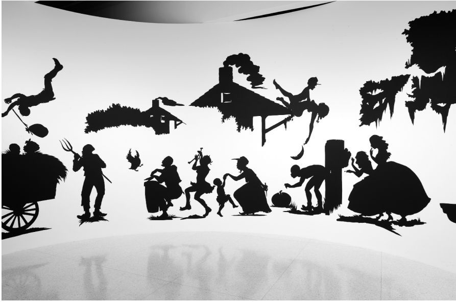
Figure 7 Kara Walker, Slavery! Slavery! Presenting a GRAND and LIFELIKE Panoramic Journey . . . [detail] (1997). Cut paper on wall, 11 × 85 feet (3.4 × 25.9 m). Installation view: Kara Walker: My Complement, My Enemy, My Oppressor, My Love , Walker Art Center, Minneapolis, 2007.

brutally treated by schoolteacher: They are tortured, hanged, burned to death, driven mad, or quickly sold. Paul D, the only male survivor, is manacled, shackled, collared, fitted with a bit, and finally sold. He ends up working on a chain gang. In Walker's silhouettes, we can easily find these figures of tortured, abused, humiliated, and mutilated slaves. Indeed, Sweet Home is ironically named to highlight these brutal aspects of slavery as well as "to expose its illusory nature." 28