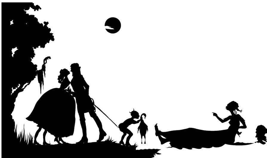
Figure 8 Kara Walker, Gone, An Historical Romance of a Civil War as it Occurred between the Dusky Thighs of One Young Negress and Her Heart [detail] (1994). Cut paper on wall, 15 × 50 feet (4 × 15 m).

As if to challenge the seductive power of such mythology, Walker subverts and parodies the Southern romance in her 1994 mural, Gone, An Historical Romance of a Civil War as It Occurred between the Dusky Thighs of One Young Negress and Her Heart (fig. 8). As the title evokes Mitchell's novel and its film version, the work seems to represent, at first glance, the iconography of the plantation romance. Yet, such a sentimental impression is soon undermined by the legs of somebody else, probably a young male/female lover, hiding beneath the belle's garment. Here, the hoop skirt, "a symbol of morality and virtue of Southern women," 30 does not protect their virtue but disguises their repressed desire. The man's sword also points to the bottom of a little black boy with hair bobs like the devil's horns. He displays a strangled bird to a female figure whose lower body is disproportionately elongated. According to the art critic Annette Dixon, this black boy holds up a swan, which symbolizes racial mixing in Walker's silhouettes. 31 Does the boy's gesture imply the miscegenation between this gentleman and the black woman floating on the river? As we move our attention to the right, a landscape of lustful events unfolds and the silhouettes become more and more difficult to decode. Although objects like a sword, a bust, a pumpkin, and a broom