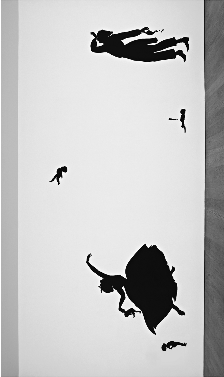
Figure 4 Kara Walker, Untitled (2002). Cut paper on wall, 8.5 × 21 feet (2.6 × 6.4 meters). Courtesy of Sikkema Jenkins & Co., New York.