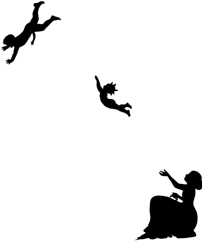
Figure 3 Kara Walker, An Abbreviated Emancipation (from the Emancipation Approximation) [detail] (2002). Cut paper on wall, 9 × 89 feet (2.7 × 27.1 meters).

Yet such conflation of infanticide with maternal love is problematized by the figure of Beloved , who appears not as an innocent child victim but as a vengeful spirit or a spiteful reincarnated ghost of Sethe's dead daughter. Simultaneously, the text undermines Sethe's maternal love, describing another kind of infanticide committed out of rage and hatred. Sethe's own mother killed all the children fathered by whites who had raped her during the Middle Passage and afterward: "She threw them all away but [Sethe]. The one from the crew she threw away on the island. The one from more whites she also threw away. Without names, she threw them" ( B 62). Ella, representative of the community women, also