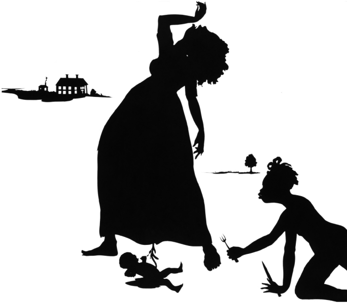
Figure 1 Kara Walker, Untitled (1995). Cut paper on canvas, 48 × 54 inches (121.9 × 137.2 cm).