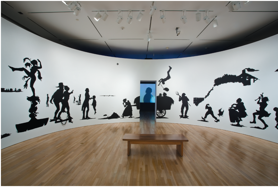
Figure 5 Kara Walker, Slavery! Slavery! Presenting a GRAND and LIFELIKE Panoramic Journey into Picturesque Southern Slavery or “Life at ‘Ol’ Virginny’s Hole’ (sketches from Plantation Life)” See the Peculiar Institution as never before! All cut from black paper by the able hand of Kara Elizabeth Walker, an Emancipated Negress and leader in her Cause [detail](1997). Cut paper on wall, 11 × 85 feet (3.4 × 25.9 m). Installation view: Kara Walker: My Complement, My Enemy, My Oppressor, My Love, Hammer Museum, Los Angeles, 2008.

when a white mistress enters the yard of the slave quarters and finds a slave man playing the banjo and a slave child dancing with his mother. Johnson is known as “a painter of black scenes” who introduced the perspective of African American slaves into his pictures and created an ambiguous image of slavery that was acclaimed by both antislavery and proslavery advocates. 25 Produced two years before the outbreak of the Civil War, however, Johnson’s Old Kentucky Home has been generally recognized as perpetuating the myth of a harmonious plantation life while disguising the inhumane treatment of slaves that defines the peculiar institution of American slavery. 26