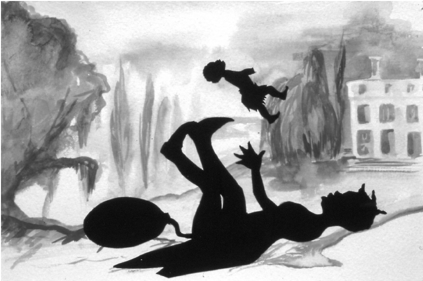
Figure 2 Kara Walker, Negress Notes (1995). Collage, ink, gouache, graphite, and watercolor on paper, 6 × 9 inches (15.2 × 22.9 cm).