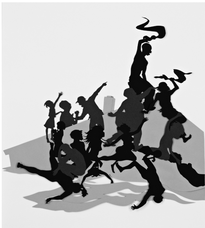
Figure 13 Kara Walker, New Yorker Cover Aug. 27, 2007, Katrina—Adrift (after Géricault) (2007). Cut paper on paper, graphite, 25.625 × 19.875 inches (65.1 × 50.5 cm).