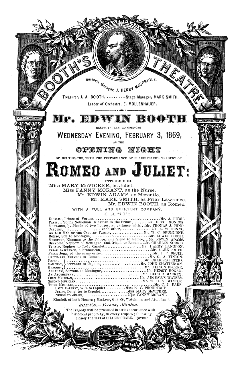
Illustration 3 "Romeo and Juliet Program" 1869?